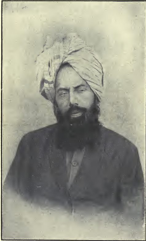
حضرت مسیح موعود علیہ السلام